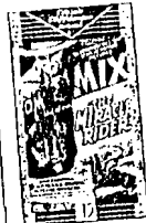
MIRACLE RIDER (15 Chapters) One of the world's favorite cowboy stars. Tom Mix plays Texas Ranger who saves the "Beverly" from the ruthless villain "Zaroff". 1941. 100 pages